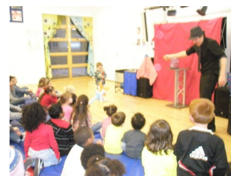
Jezo in action