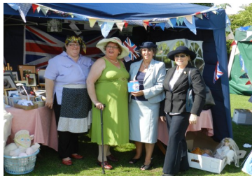
The Camera Club stall at the 2011 Chesterton Festival

Chesterton', and we received 37 entries for the over-18s category, which we thought was quite good for a first year. The club was so inspired by entries that we have now produced a DVD showing a pictorial walk around Chesterton, and sold 100 copies, which is very satisfying.