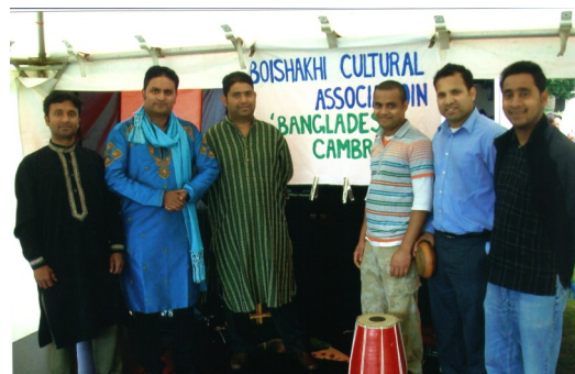
Boishaki Cultural Association

He describes Bangladesh as a "hospitable" place and it was there, when growing up, that he first became aware of the